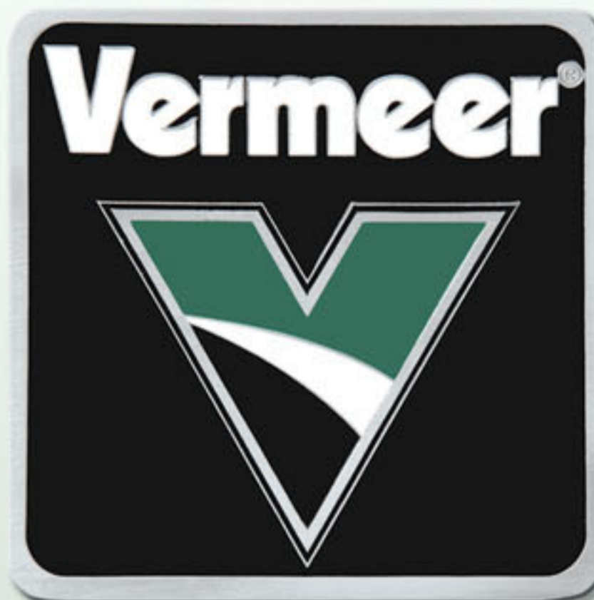
5" Bottle Opener Hitch Cover