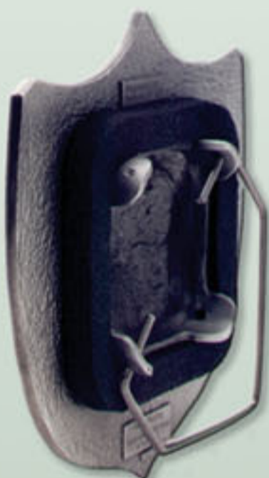
Backside with Flange, Gasket & Insert Wireform